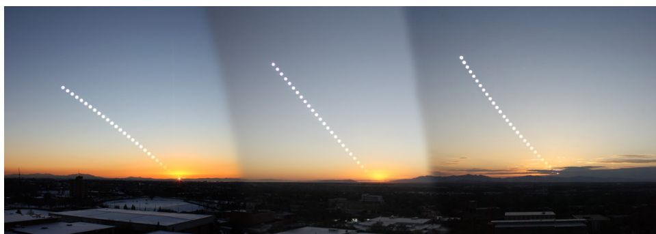
FIG. 2. Three overlaid sequences of photos of the setting sun, taken near the December solstice (left), September equinox (center), and June solstice (right), all from the same location at 41^{\circ} north latitude. The time interval between images in each sequence is approximately four minutes.

For photographs and other images that are inherently made of pixels (that is, rasters or